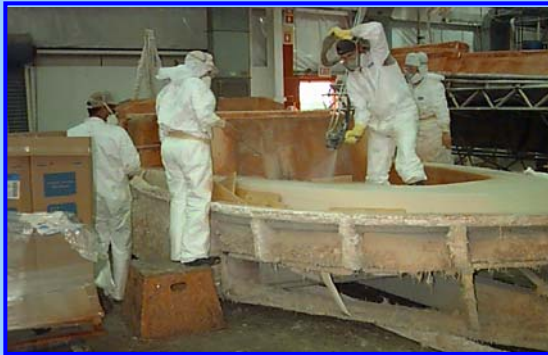
Conventional hand lay-up for boat building