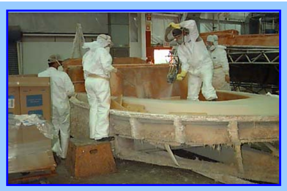
Conventional hand lay-up for boat building