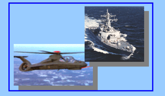
Applications of acoustic composites