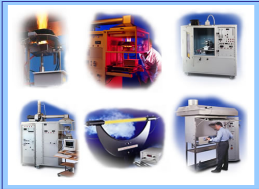
FST testing of composites